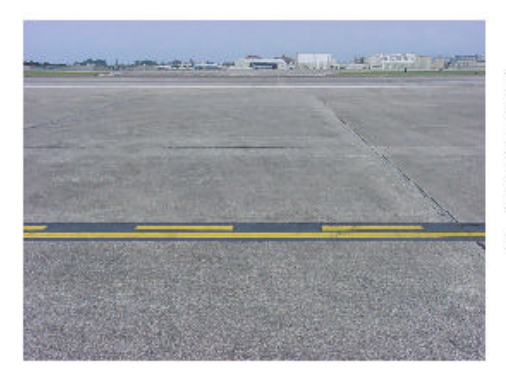
Figure 5.1. Airfiled Markings.

Hold line: A solid yellow line adjacent to a dashed yellow line, located 100 feet from the edge of the runways, helipads, and the VTOL pad. Vehicles and aircraft must contact the control tower and obtain permission prior to proceeding beyond the hold line.