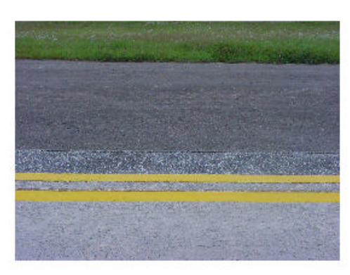
EDGE OF STRESSED PAVEMENT MARKING: A double yellow line used to mark the edge of the pavement stressed to support aircraft.

INSTRUMENT HOLD LINE: These lines consist of two parallel solid yellow lines with vertical stripes and the letters "INST" stenciled on the movement surface facing the driver. Instrument hold lines are located on taxiways Alpha, Bravo, Echo, and Foxtrot.